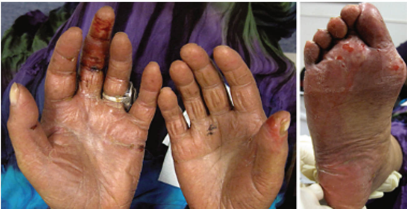
Figure 1. This figure shows the diffuse erythema and fissuring of the palms with focal erosions on the fingers (A) and the right foot (B).

Research reported the factors related to HFS incidence to be the hemoglobin levels with a 12 mg / dl cut-off, which is significantly associated with this syndrome. 9 Other HFS-associated causes in other studies are age, sex, performance status ECOG, number and location of metastasis, findings of physical examination, the cancer type,