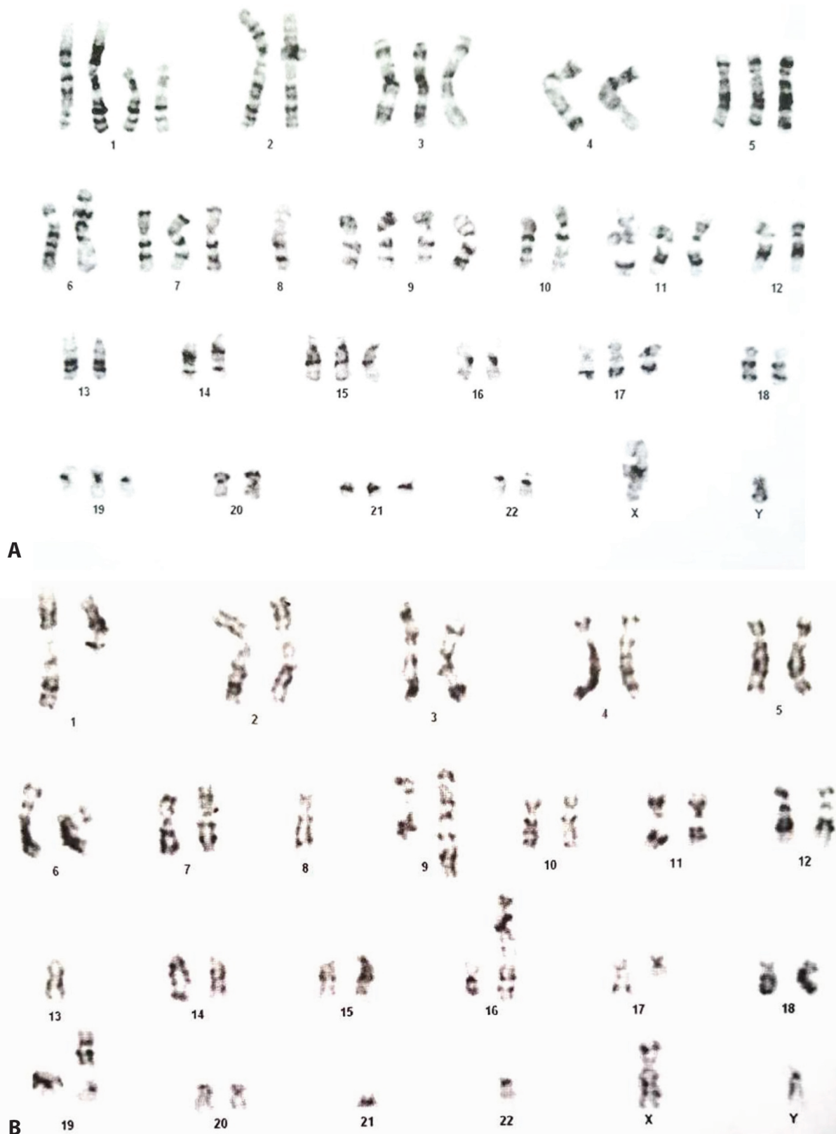
Figure 3. A. Hyperdiploidy in plasma cell myeloma with the gain of odd number chromosomes and 1p deletion (ISCN result: 57,XY,+1,+1,del(1)(p13) ×2,+3,+5,+7,-8,+9,+9,+11,+15,+17,+19,+21); B. Hypodiploidy in plasma cell myeloma with monosomy 13, 21, 22, and deletion of chromosome 17 long arm. Unbalanced translocation of chromosome 1q to chromosomes 9,16, and 19 was another finding which resulted in 1q gain (ISCN result: 42,XY,-8,der(9)t(1;9)(q10;q34),-13,der(16)t(1;16)(q12;q24),del(17)(q12),der(19)t(1;19)(q21;p13),-21,-22).