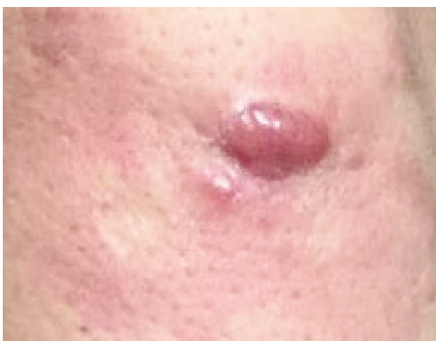
Figure 1. Pretreatment photograph of nodular erythematous skin lesion from the patient's forearm.

A 49-year-old man with a history of nodular sclerosis HL presented with cutaneous lesions two years after completion of his treatment. In 2007, he presented for the first time with right solitary axillary lymph node enlargement. After biopsy and histologic examination, as well as staging work up evaluation, he was considered to have stage I (Ann Arbor Classification) nodular sclerosis HL and treated with ABVD regimen chemotherapy. He obtained complete response after eight cycles of chemotherapy. Approximately two years after completion of the treatment, he found two large separate asymptomatic erythematous nodular non-ulcerated cutaneous lesions in his right arm and forearm (Figures 1, 2). These cutaneous lesions began approximately three months prior and did not resolve with medication. He had no B symptoms such as fever, weight loss or night sweats. General physical exam revealed no lymphadenopathy or organomegaly. With the exception of an elevated C-reactive protein, other laboratory tests were within normal range. He underwent a biopsy of the skin lesions suggestive for HL involvement, which was subsequently confirmed by pathologic review and Immunohistochemistry (IHC) results.