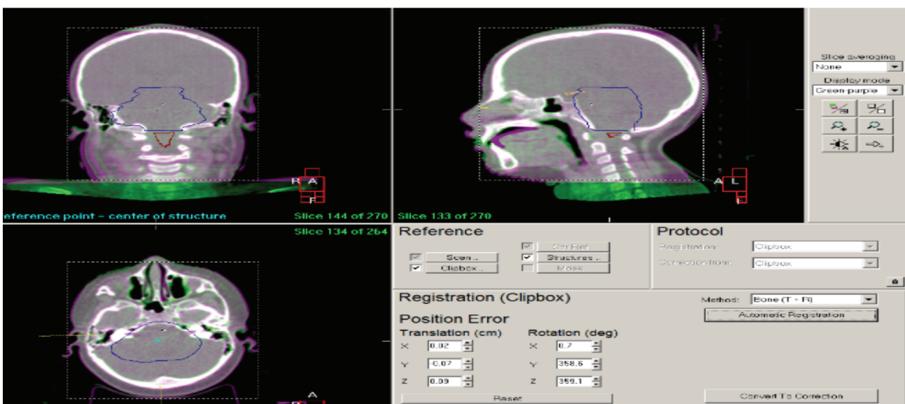
Figure 2. CBCT scan matching registration was done with the reference CT images, and the setup deviations were recorded.

The following results reveal the deviations in patient positioning detected by CBCT and Catalyst during all scheduled radiation treatment sessions, totaling 252 sessions. These deviations were assessed for each of the six degrees individually. In this study, translation degrees (lateral, vertical, and longitudinal) were expressed in centimeters (cm), while the rotational degrees (rotation, roll, and pitch) were expressed in degrees (°).