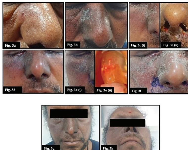
Figure 3. This figure presents clinical photographs of the patient throughout the treatment course. (a) At the initial presentation, (b) Grade 1 dermatitis was observed two weeks after the initiation of radiation, (c) (i) Dermatitis after three weeks of radiation, (c) (ii) Grade 3 mucositis of the nasal cavity at three weeks, (d) Progression of dermatitis at the lower eyelid level, (e) (i) Dermatitis after five weeks, (e) (ii) Candida patch observed at the hard palate at the fifth week, (f) Dermatitis observed after the treatment, and (g) and (h) Grade 1 dermatitis and Grade 1 mucositis of the nasal cavity, two weeks after the completion of radiation.

Yong Yang et al. in 2015 9 suggested a risk-adapted therapy for early-stage ENKTCL in which the patients were classified as either low or high risk using five independent prognostic factors such as stage, age, performance status, lactate dehydrogenase levels, and primary tumor invasion. It was seen that radiotherapy alone for the low-risk group was adequate compared with the