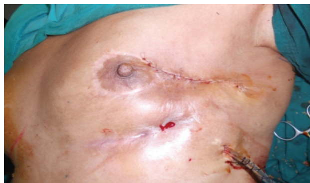
Figure 3. A 57-year-old female patient with a history of smoking, diagnosed with cancer of the left breast was treated by nipple sparing mastectomy (NSM). After adjuvant radiotherapy, the patient had exposure of the implant. The implant was removed and she had delayed correction by lipofilling.