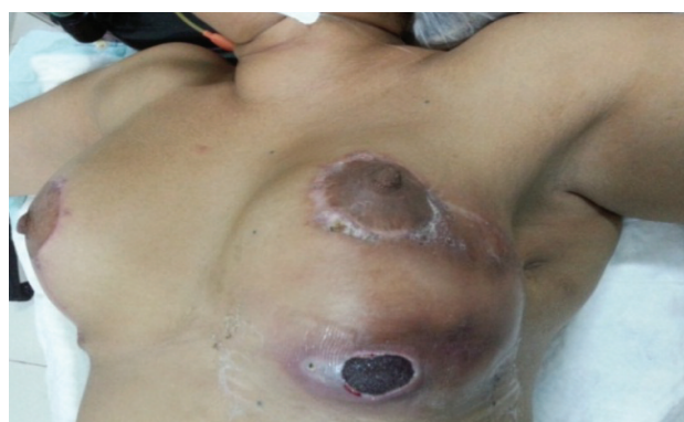
Figure 2. A 52-year-old female with left breast cancer treated by skin sparing mastectomy (SSM) and implant reconstruction. After adjuvant radiotherapy she developed capsular contraction (Baker 3). The patient underwent a capsulectomy with replacement of the implant by de-epithelialized transverse rectus abdominis myocutaneous flap (TRAM).