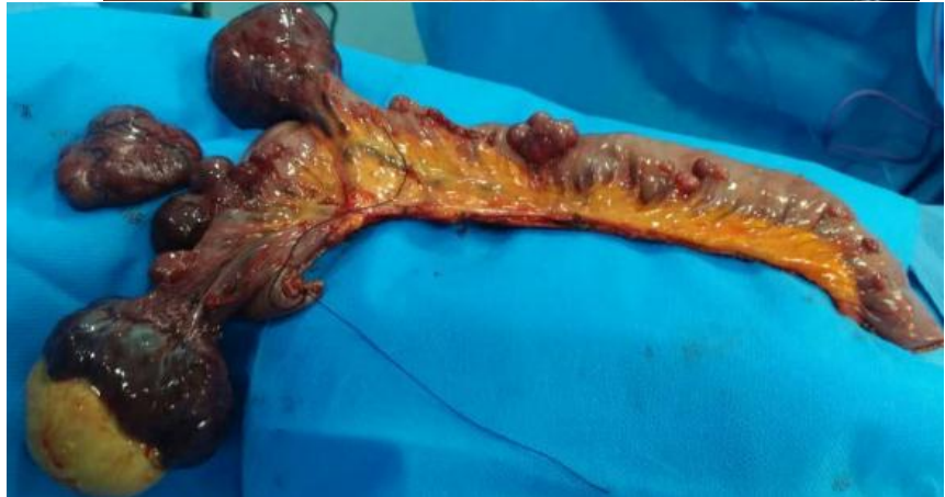
Figure 1. This pattern supported the diagnosis of low-grade GIST, the smooth muscle type. (A) Surgically removed masses from the patient; (B) The masses recovered from the patient after surgery.