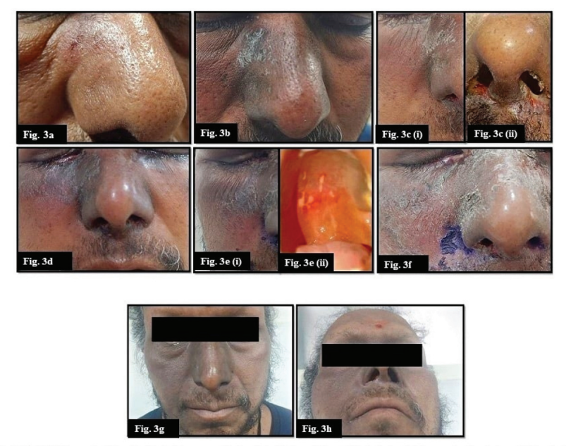
Figure 3. This figure presents clinical photographs of the patient throughout the treatment course. (a) At the initial presentation, (b) Grade 1 dermatitis was observed two weeks after the initiation of radiation, (c) (i) Dermatitis after three weeks of radiation, (c) (ii) Grade 3 mucositis of the nasal cavity at three weeks, (d) Progression of dermatitis at the lower eyelid level, (e) (i) Dermatitis after five weeks, (e) (ii) Candida patch observed at the hard palate at the fifth week, (f) Dermatitis observed after the treatment, and (g) and (h) Grade 1 dermatitis and Grade 1 mucositis of the nasal cavity, two weeks after the completion of radiation.

Yong Yang et al. in 2015<sup>9</sup> suggested a riskadapted therapy for early-stage ENKTCL in which the patients were classified as either low or high risk using five independent prognostic factors such as stage, age, performance status, lactate dehydrogenase levels, and primary tumor invasion. It was seen that radiotherapy alone for the lowrisk group was adequate compared with the