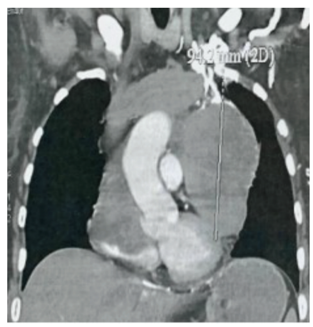
Figure 2. CT scan of a 57-year-old lady who presented with buffy face showing malignant thymoma invading the SVC with propagating thrombus to the right atrium. CT: Computed tomography; SVC: Superior vena cava

Surgery is indicated in patients with primary cardiac tumors, but there has been no standard treatment for cardiac metastases so far. Surgery is recommended for treatment in early presymptomatic cases; in this case, the treatment would not be just palliative, but curative, leading