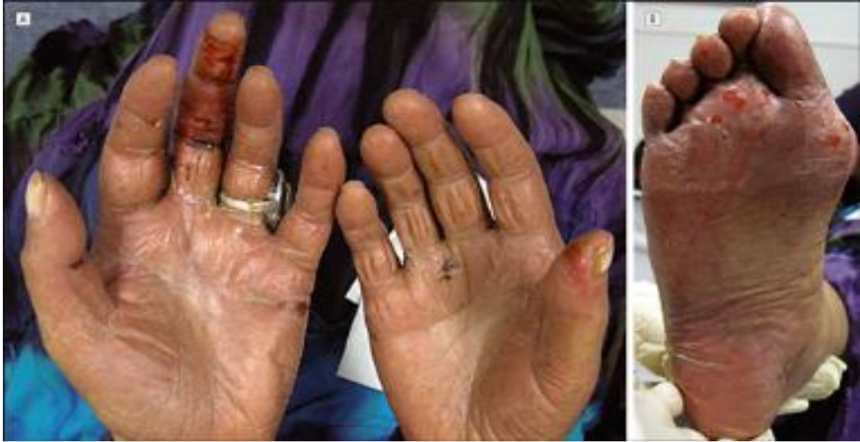
Figure 1. This figure shows the diffuse erythema and fissuring of the palms with focal erosions on the fingers (A) and the right foot (B).