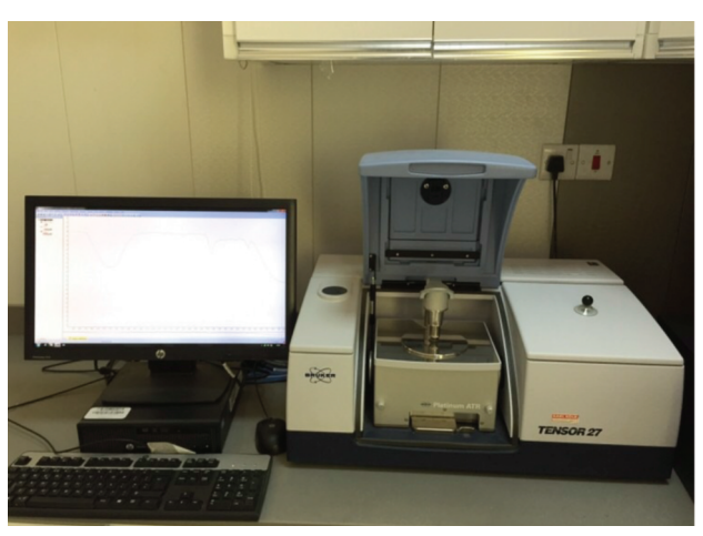
Figure 2. FTIR spectroscopy analysis of the lung tissues.