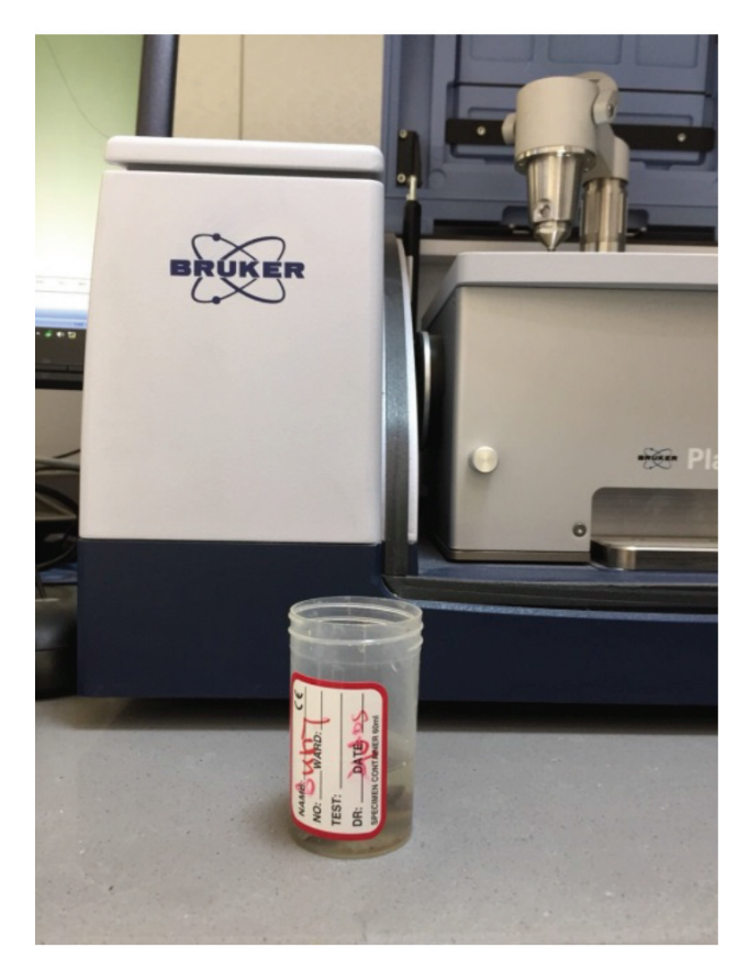
Figure 1. Lung tissue specimens immersed in formalin.

The bulk of the lung tissues were exposed to ATR-FTIR to assess its effects on the tissue (Figure 2). The IR spectrum has been used to identify the functional chemical group properties of molecules by changing the rotational vibrational movements of excited electrons. The spectrum from the red edge that had a frequency of 430 THZ to 300 GHz was found to be useful for examining the absorption and transmission of photons by exciting the vibrational modes. Thus, we could