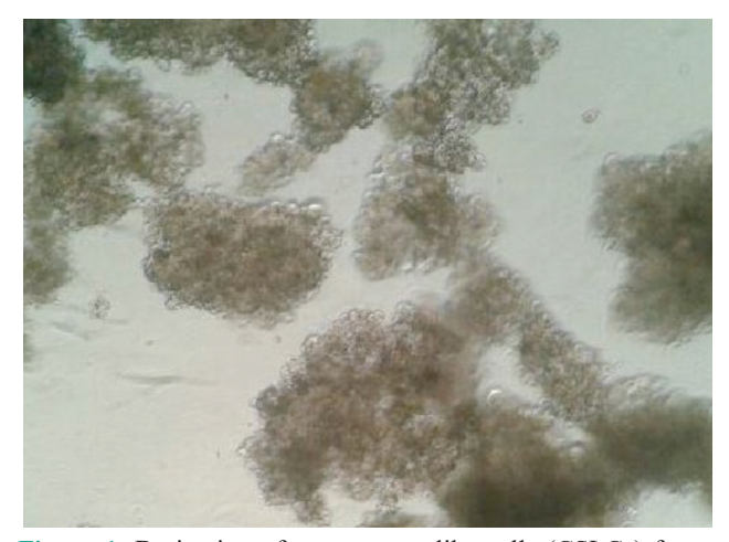
Figure 1. Derivation of cancer stem-like cells (CSLCs) from MKN-45 cells. Spheres were derived from MKN-45 cells by seeding 5\times10^4 cells in DMEM/F12 medium supplemented with 10% fetal bovine serum (FBS) on the non-adhesive surfaces of 10~\rm cm^2 culture plastic dishes coated with 1.5% agarose gel.