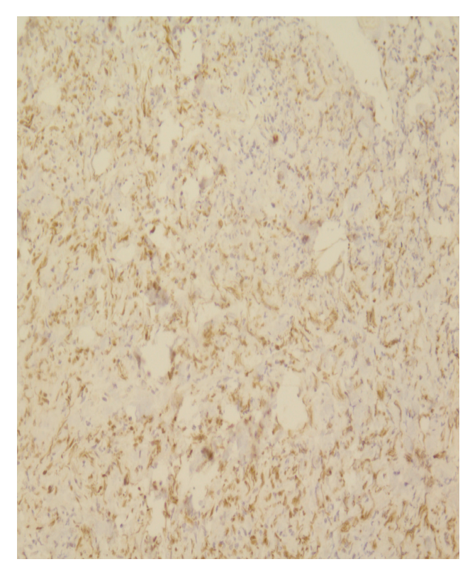
Figure 1. Immunoreactivity for PAX-5 shows nuclear staining of tumor cells (250\times) .

The patient, a 64-year-old-man, had urinary frequency for 18 months. He had no dysuria, nocturia or change in urine color. Serum PSA was 3.1 and he had normal renal function test, liver function test, and complete blood count. Urinalysis and urine cytology were normal. Abdominal and pelvic sonography showed bladder wall thickening. There were no significant findings in his history and physical examination. He had no smoking history and no history of exposure to toxins (industrial or chemical). He had no history of lymphoma in his family and no history of chronic disease. The patient underwent a transurethral biopsy and pathologic evaluations showed DLCL. Immunohistochemistry (IHC) study showed that the tumor was positive for CD20, CD45, and Pax-5,ki-67(60%) and negative for BCL-2, cytokeratin, and S100 (Figure 1-2). The abdominal and pelvic CT scan showed diffuse bladder wall involvement (Figure 3). There was no extra bladder involvement observed in the abdominal and pelvic CT scan and in the bone marrow biopsy. He had no B symptoms. The patient received 6 cycles of R-CHOP followed by 36 Gy radiotherapy to his pelvis. Six months after