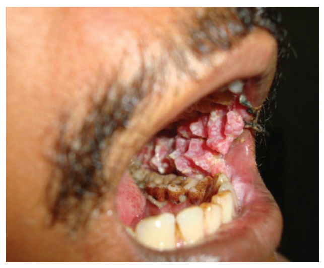
Figure 6. Sutured biopsy area in relation to carcinoma of the left buccal mucosa after biopsy of two different sites.

Hopman<sup>21</sup> in a study stated that colposcopy was an effective tool for diagnosing cervical intra-epithelial neoplasia. It was suggested that micro-invasive carcinoma was suspected