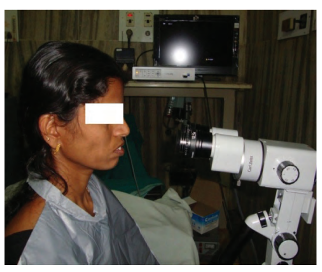
Figure 2. Patient positioning for colposcopic examination.