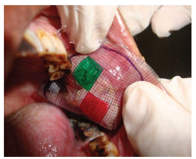
Figure 3. Placement of grid for selection of biopsy site (green color for colposcopy and red color for clinical criteria).

The study was conducted for a period of one year, from May 2010 to May 2011, in the Department of Oral Medicine and Radiology, Government Dental College and Research Institute, Bangalore, Karnataka, India. The study group consisted of 30 cases of clinically diagnosed buccal mucosa carcinoma between the ages of 30-60 years and a control group that consisted of 25 healthy, age-matched individuals.