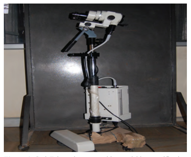
Figure 4. Carl Zeiss colposcope with a variable magnification index giving a magnification of approximately 6-20×.