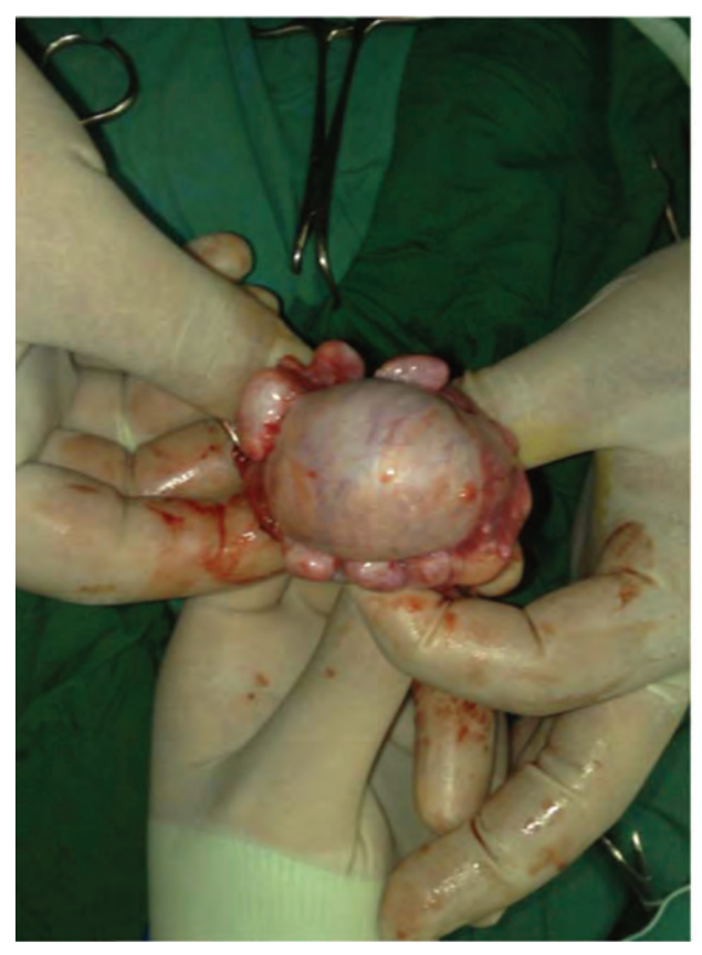
Figure 1. Multiple variable size oval shape nodules in the right epididymis.

Because of cytogenic clonality, the recurrent involvement of chromosomalregion 2P23, occasional aggressive behavior and metastatic potential of IPT, some recent studies have proposed that IPT may be a neoplasm.<sup>6</sup>