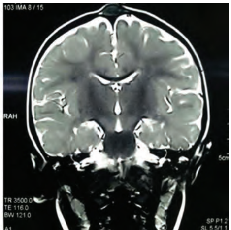
Figures 1 and 2. Magnetic resonance image (MRI) of melanotic neuroectodermal tumor of infancy (MNTI).