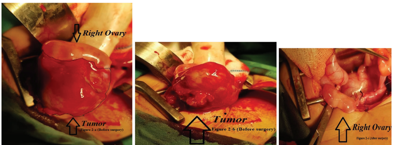
Figure 1. (a, b, and c) In this figure, the ovarian photos are displayed.

Macroscopic anatomy showed an ovarian mass consists of multiple fragments of irregular grayish-brown tissue, a total of 5×3.5×3.5cm. Simultaneous involvement of the right fallopian tube was also observed. Also, Paratubal tissue was composed of two small fragments of irregular creamy-gray tissue, totally 0.5×0.5×0.3cm.