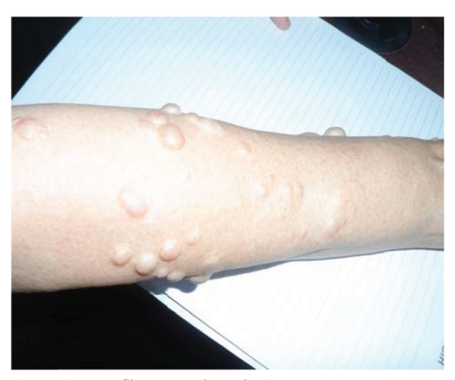
Figure 1. Neurofibroma on the patient's arm.

Bone marrow aspiration was remarkable for hypercellularity and the M:E ratio was 3.6:1. There was an increased myeloid series with a shift to the left and the presence of 46% myeloblasts (Figure 2). The patient's karyotype was 46, XX with t(9;22)(q34;q11.2) (5)and diploid female clone of 46,XX (2). Immunophenotyping results of cluster of differentiation (CD) were: CD3 (7%), CD13 (30%), CD33 (35%), andCD5 (5%). Skin biopsy confirmed the presence of