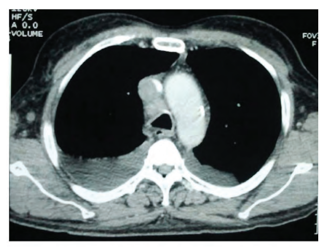
Figure 2. Contrast enhanced CT scan of the thorax showing a nodular lesion in the right lower lobe, bilateral pleural effusion with mild pericardial effusion and almost complete occlusion of the superior vena cava (SVC) by thrombosis.

was suggested to be metastasis of cancer cells to the SVC vessel endothelium from lymphatic drainage through the thoracic duct that lead to the left innominate vein via the left jugulo subclavicular angle.<sup>5</sup> The attachment of metastatic cells to the vessel endothelium was considered as the trigger to thrombus formation, considering the existence of malignant cells in the intra-SVC thrombus.<sup>5</sup>