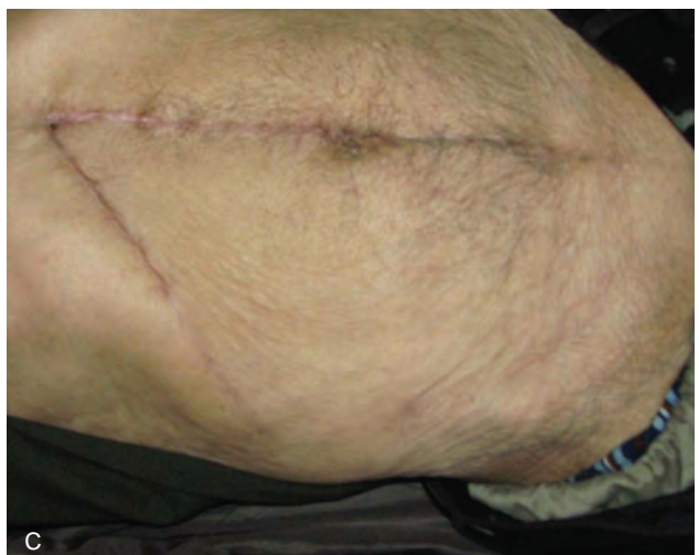
Figure 2. Left subcosto-midline incision (A); Appearance of the site of the right subcosto-midline incision several days after surgery (B); Appearance of the site of left subcosto-midline incision two months after the surgery (C).