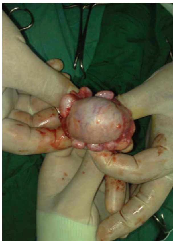
Figure 1. Multiple variable size oval shape nodules in the right epididymis.

Because of cytogenic clonality, the recurrent involvement of chromosomal region 2P23, occasional aggressive behavior and metastatic potential of IPT, some recent studies have proposed that IPT may be a neoplasm. 6